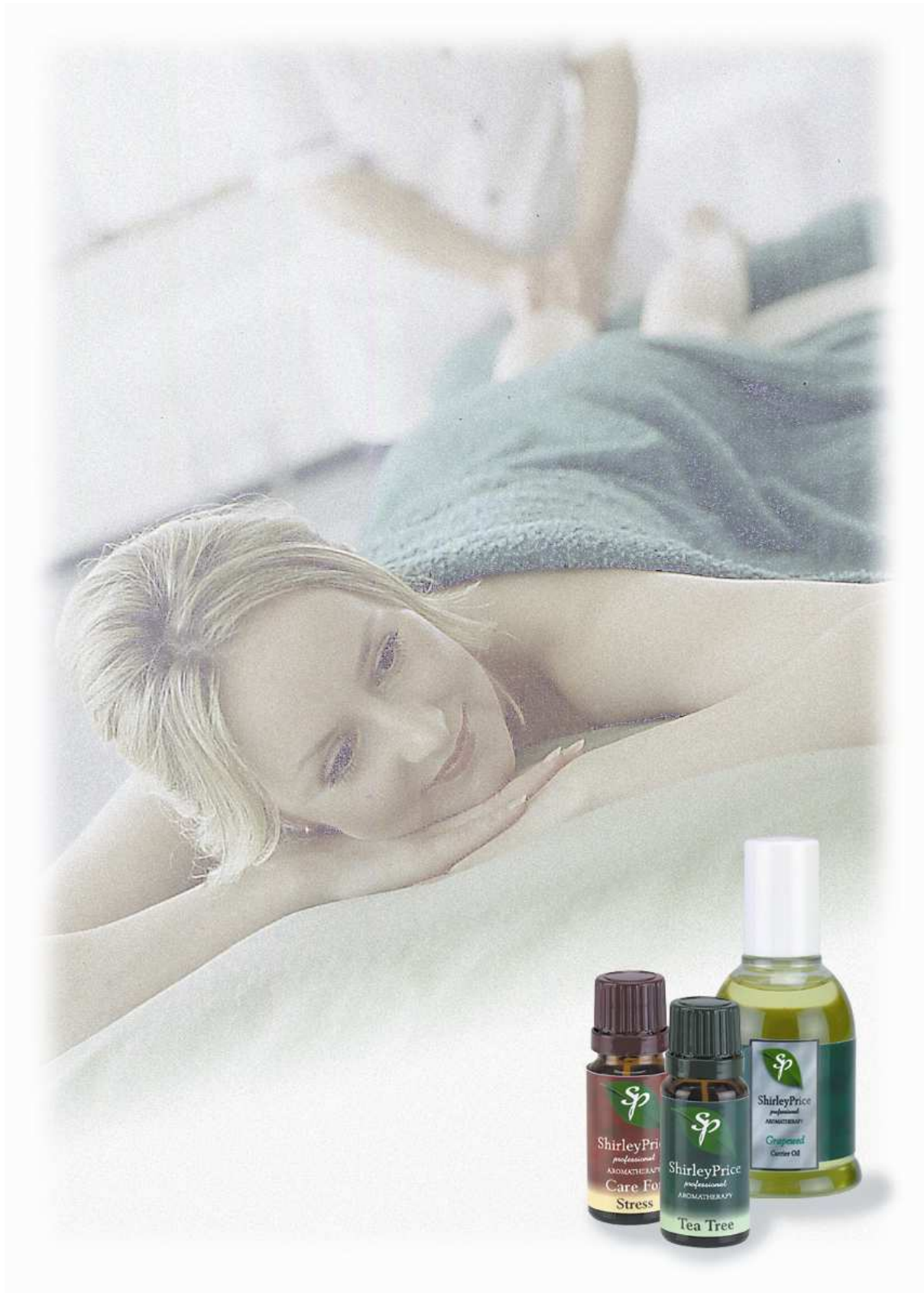
The Shirley Price Every Day Aromatherapy Guide