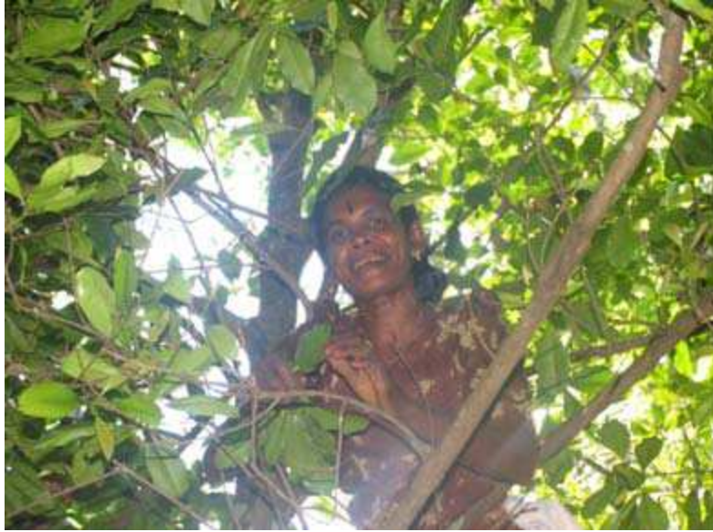
Clove harvested high in the trees

CYPRESS ( Cupressus sempervirens )/Cupressaceae, astringent, toning, restoring, middle to base