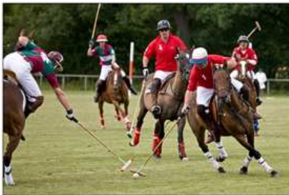
POLO DREAMS vs PYTCHLEY JULY CUP, RLS Polo Club

Certainly in both East and West plants and the essential oils and waters derived from them have traditionally been used to help men maintain a decisive positive attitude. For thousands of years plant extracts and massage therapy have been found to aid vitality and mental performance. Taken with a reduction in stimulants, good nutrition and exercise aromatherapists are able to support male and female clients achieve better health.